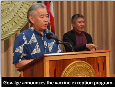
Gov. Ige announces the vaccine exception program.

In this pandemic, every milestone counts. For Hawai'i, the good news is that we've opened vaccinations to anyone age 16 and up, we're making it easier for fully vaccinated residents to travel intercounty if they received their shots in Hawai'i and we're laying the groundwork in communities statewide for more mindful tourism as summer approaches. The state also took center stage for Earth Week as a global leader in fighting climate change — a top priority of the Ige and Biden administrations.