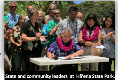
State and community leaders at Hā'ena State Park.

A. We're embarking on a new Hawai'i 2.0 course for the visitor industry. We want visitors who respect our norms, our environment and our Hawaiian culture. The Hawai'i Tourism Authority (HTA) and the rest of us in state leadership recognize the need to manage the number of visitors — especially for "hotspots" in our communities, as we've done at Hā'ena State Park on Kaua'i . We also need to do a better job of clamping down on illegal vacation rentals in residential neighborhoods and investing more tourism dollars in natural and cultural resources. HTA is taking a comprehensive approach to destination management based on the "four pillars" of its strategic plan: natural resources, Hawaiian culture, community engagement and responsible travel.