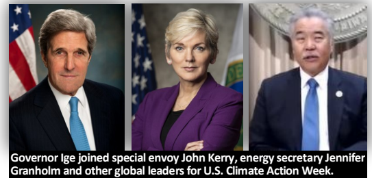
Governor Ige joined special envoy John Kerry, energy secretary Jennifer Granholm and other global leaders for U.S. Climate Action Week.

In a series of high-profile U.S. Climate Action Week events viewed around the world last month, Governor Ige highlighted Hawai'i's leading role in addressing global warming and transition to renewable energy. The sessions focused on the United States' renewed commitment under the Biden administration to take "bold action" on climate change and join with other nations to reduce greenhouse gas emissions. The governor emphasized, "Hawai'i was the first U.S. state to commit to 100 percent renewable power by 2045 —and we're excited the Biden administration is looking to raise that ambition for the entire country."