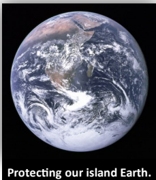
Protecting our island Earth.

The governor also joined several other U.S. Climate Alliance governors for a discussion of how the states and the Biden administration can expand economic opportunity through collaborative climate action. "Addressing climate issues can and should play a significant part in our pandemic recovery," said Governor Ige. "Making the transition to renewable, indigenous resources for power generation allows us to keep at home at least $4 billion currently spent out of state for oil. We save on electricity bills and generate jobs—in turn improving our economy, environment and energy security." He added, "As an electrical engineer and businessman, I understood (back in 2015) the future is 100 percent renewable. And even though we don't know exactly what that future will look like, we do know that putting out that North Star, making that commitment was important to drive how we transform Hawai'i's economy."