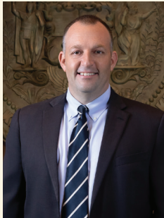
Governor Josh Green, M.D.

From the beginning when we began our Administration's work, we outlined the priorities that we would be focusing on. One of these was seeking solutions to support the homeless by taking actions that would work toward achieving long-lasting change. Within the pages of this newsletter, you will find one such project, Pūlama Ola, our Administration's first medical respite