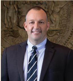
Governor Josh Green, M.D.

Summer offers exciting opportunities for connection within the community. Recently, we unveiled the Ala Moana walkway, which provides a new pedestrian bridge linking Ward Village to Ala Moana Regional Park, allowing people to traverse safely between the busy Kakaako area and the nearby beach park.