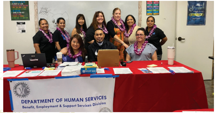
The BESSD Team at a Rapid Response event.

The Department of Human Services (DHS), through its Med-QUEST Division and the Benefit, Employment and Support Services Division, joined We Are Oceania and other state partners in a Rapid Response event to support individuals impacted by job layoffs.