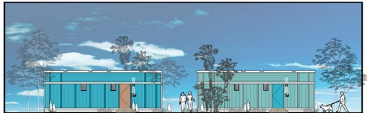
SAMPLE CONCEPT ELEVATION 1