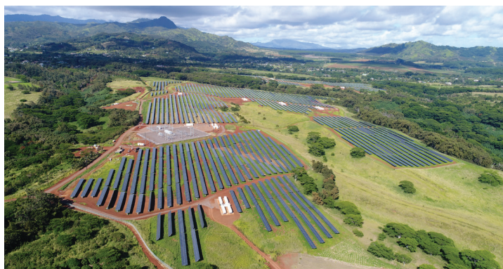
Applied Energy Service's (AES) Lawai Project.

Kaua'i offers a preview of the electrical future, says Hoke, especially for places where utilities are now, or soon will