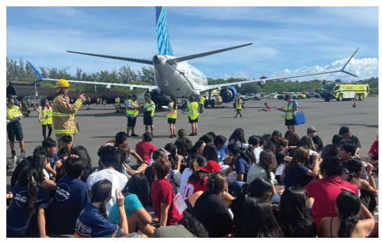
Public school students watch and listen to a firefighter at the drill.

Nearly 100 public school students along with airline personnel, Maui County's Emergency Management Agency (MEMA) and mutual aid partners joined the Hawai'i Department of Transportation in a triennial emergency exercise at Kahului Airport (OGG) on Sept. 20.