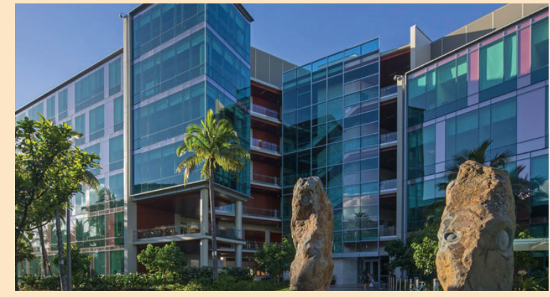
Exterior of the UH Cancer Center.

The designation places UHCC in the top 4% of all cancer centers in the U.S. and recognizes its high-quality, impactful work in the global fight against cancer. The designation comes with an $11 million cancer center support grant by NCI to help fund additional research for five years. The center is the only NCI-designated cancer center in Hawai'i and the Pacific.