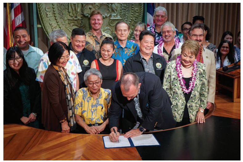
Governor Green signs HB 2404, the largest income tax cut in history.

The second phase of GAP was signed into law this year, introducing the largest income tax cut in Hawai'i's history for low- and middle-income families. By eliminating the lowest tax brackets in odd years and lowering tax rates in even years, the administration aims to reduce income tax payments by 71% by 2031. This means that a family of four with a median income of $88,000 will see an additional $3,613 in take-home pay by the end of the decade.