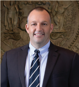
Governor Josh Green, M.D.

As your Governor, I would like to take a moment to share with you what our state has accomplished this past month. In line with my administration's priorities, I have signed an executive order to advance our state's renewable energy initiatives, ensuring we remain on track to achieve our goals. Additionally, I am pleased to