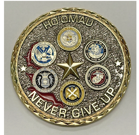
Special military coin that was given to the BFTs.