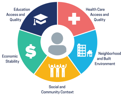
Social Determinants of Health Copyright-free Healthy People 2030

The College of Social Sciences at the University of Hawai'i at Mānoa, in partnership with the Office of Wellness and Resilience in the Office of the Governor, recently launched the 2024 Hawai'i Quality of Life and Well-Being Dashboard. Surveying more than 8,000 residents statewide, the dashboard provides an in-depth look at pressing social, economic and health issues affecting Hawai'i residents. It is now the largest statewide survey on health in Hawai'i ever conducted, as well as the largest dataset using the Center